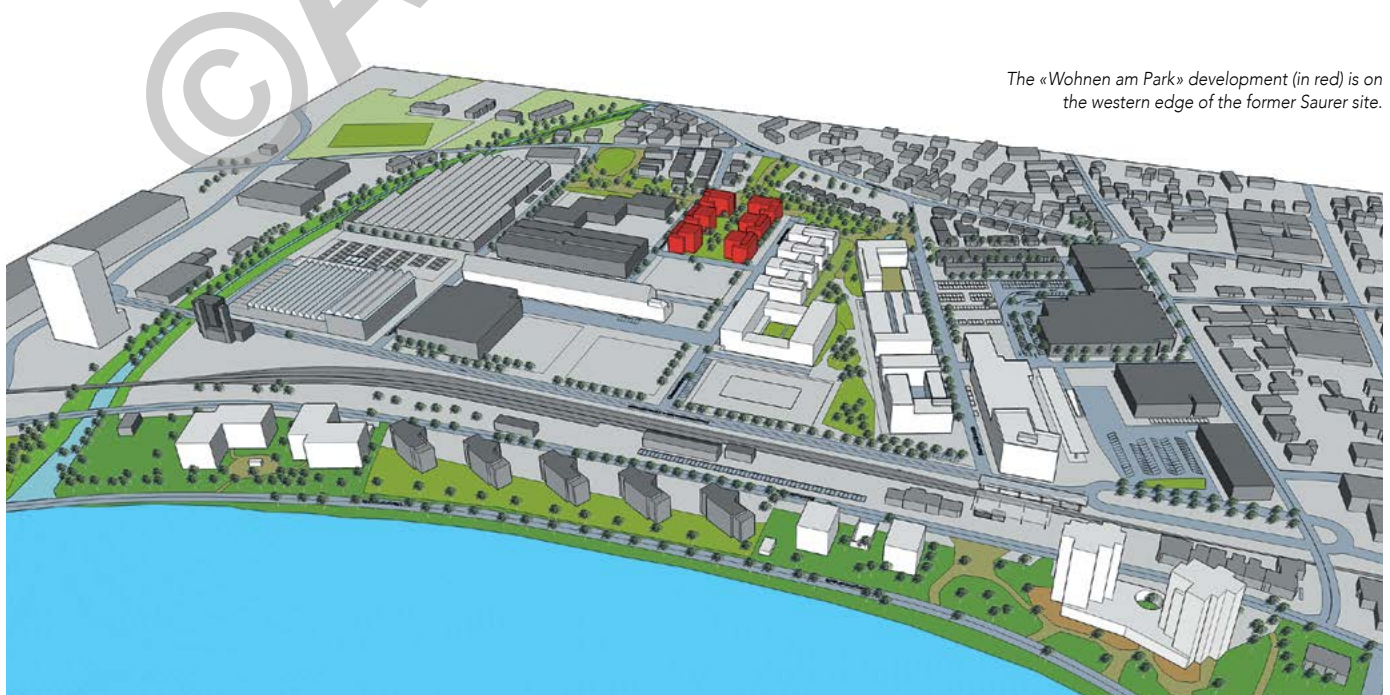
The «Wohnen am Park» development (in red) is on the western edge of the former Saurer site.